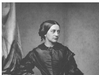
Clara Schumann (1819-1896)

While the first published title, “Gran Duo” cannot with total accuracy be ascribed to Schubert himself, it is simply the best description of the work.